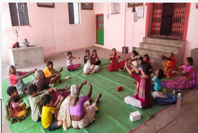
Image 2 – A group of female senior citizens engaged in regular exercise