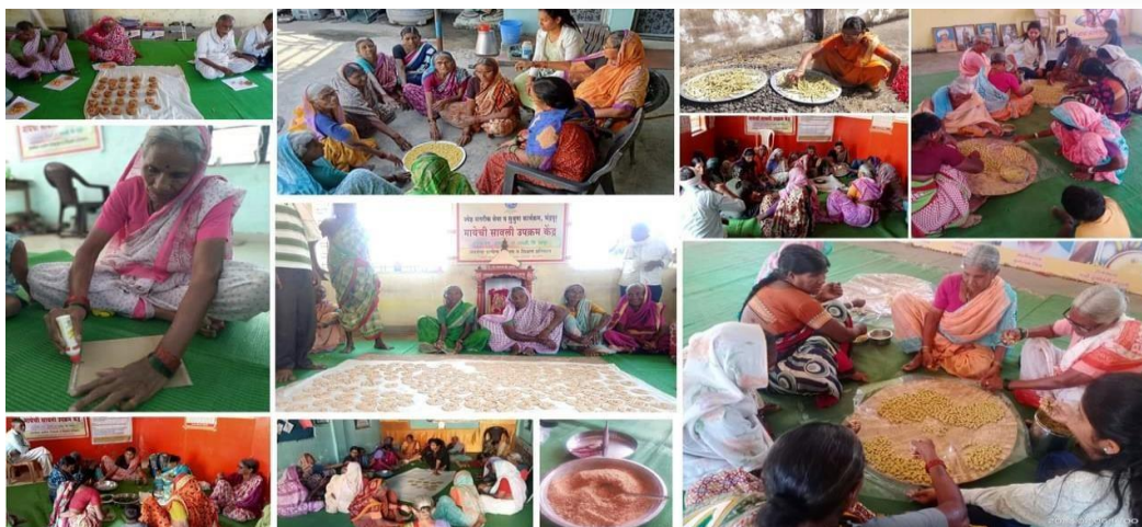
Image 3 – Groups of senior citizens from various centers are engaged in making the edible items for Agro Exhibition 2023